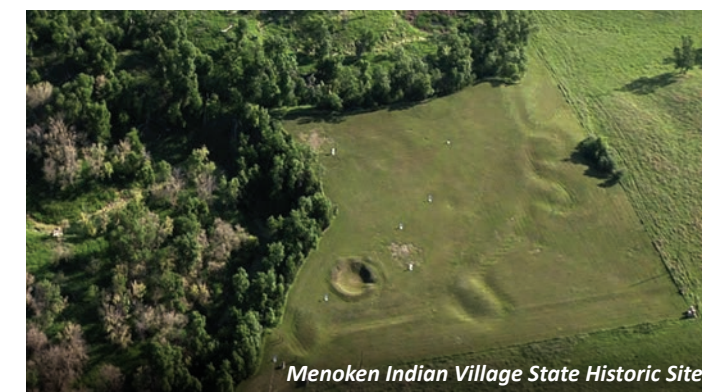
Menoken Indian Village State Historic Site

This small settlement is tucked away on a bluff overlooking an abandoned meander of Apple Creek, a small tributary of the Missouri River. Menoken is one of the oldest fortified sites in the region. Look for the most prominent feature at the site,