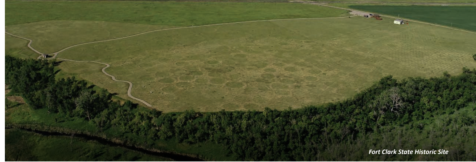
Fort Clark State Historic Site

Follow signs along walking paths to learn about this site and enjoy magnificent views. Launch a canoe here in summer. Open year round.