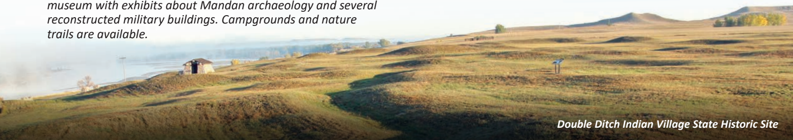
Double Ditch Indian Village State Historic Site

Year-round, the preserve offers activities such as day hiking and cross-country skiing. Preserve pamphlets and nature trail brochures are available. For primitive camping, log cabins, and an interpretive center, visit nearby Cross Ranch State Park.