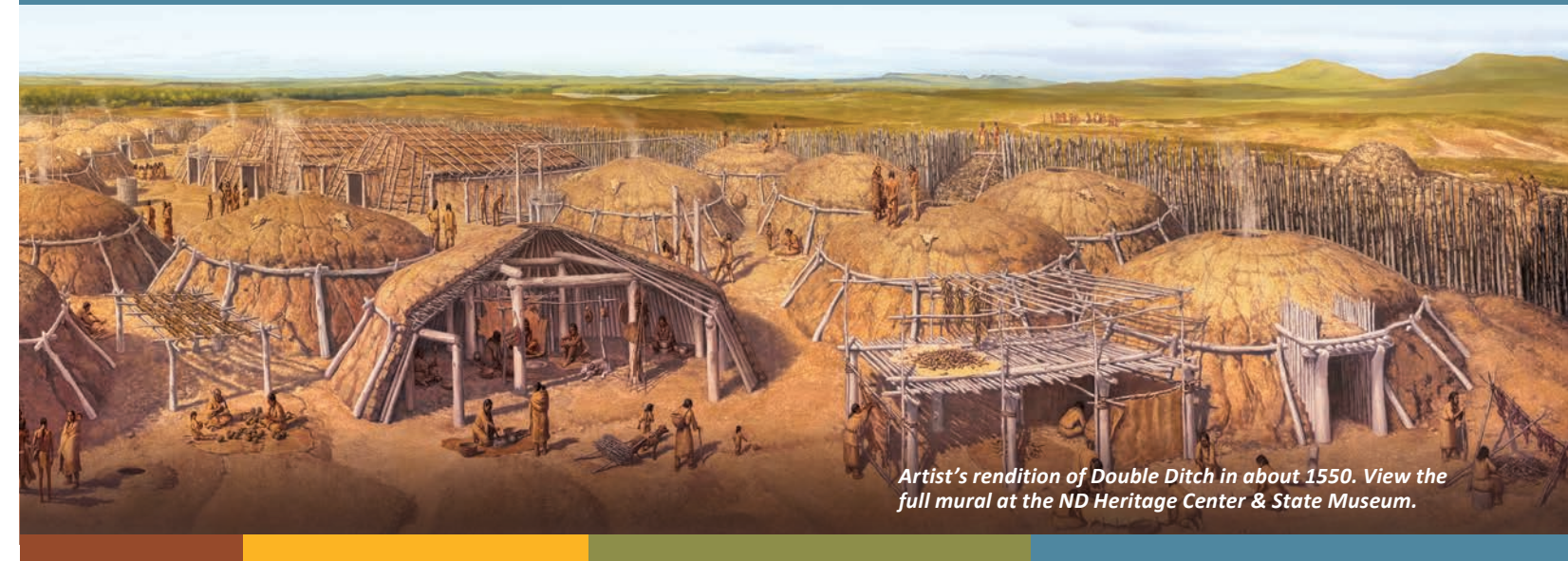
Artist's rendition of Double Ditch in about 1550. View the full mural at the ND Heritage Center & State Museum.

Explore archaeological remains of prehistoric and historic villages occupied by the Mandans, Hidatsas, Arikaras, and their ancestors. Please respect and protect the resources as you visit these historic treasures.