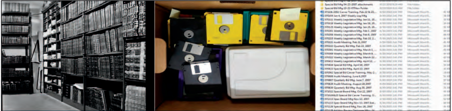
Progression of records throughout the history of North Dakota. Left: Record books in storage at the Stark County Courthouse in Dickinson, 1937 (30573-00119, detail). Middle: Box of floppy disks created in the early 1990s waiting to be ingested into the digital repository. Right: A screenshot of digital records in the digital repository. Records now take up server space instead of shelf space.