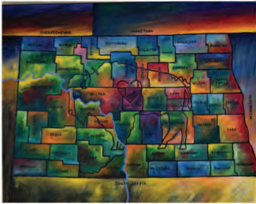
North Dakota acrylic painting by Paul Noot

The North Dakota Art Gallery Association and the North Dakota Council on the Arts, with support from Starion Bank, organized two exhibits to celebrate the 50th anniversary of the North Dakota Council on the Arts. The exhibits display the artwork of 50 North Dakota artists. One of these exhibits is on display in the ND Heritage Center & State Museum through April 30, 2017, and the other will tour the state during the anniversary year. Learn more at bit.ly/paaverud .