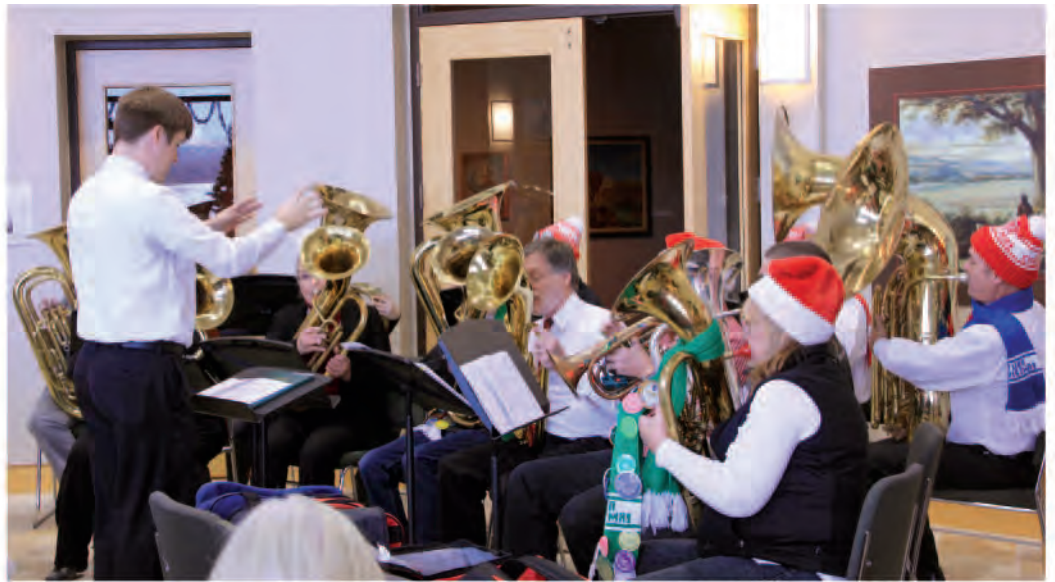
Christmas Tubas perform at the Missouri-Yellowstone Confluence Interpretive Center in 2015.

For the latest updates and more information on statewide holiday events, visit history.nd.gov/events .