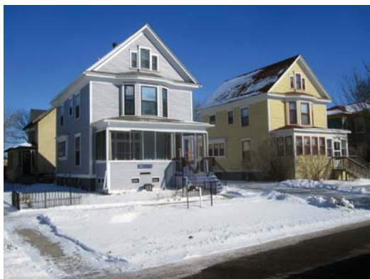
Top: Ashley Jewish Homesteaders Cemetery Bottom: M. E. Beebe Historic District