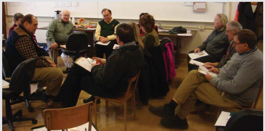
The newly established Friends of the Welk Homestead met in Strasburg on Feb. 14.