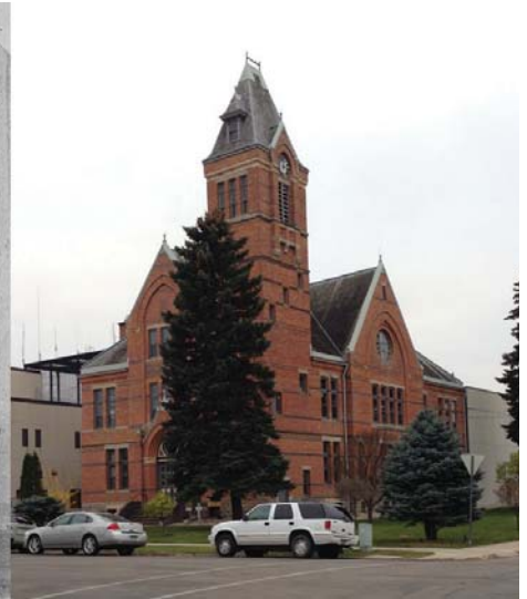
The 1883 Stutsman County Courthouse shortly after completion in 1883 (SHSND SA 1005-0002) and today. The courthouse is unique in that exterior of the building has remained virtually unchanged for more than 130 years.

Recent years have seen many changes and updates throughout the courthouse. The addition of a new mechanical and boiler system in 2014 provided a welcome source of heat for a building that stood empty for over 30 years. After a generous $350,000 appropriation from the 64th State Legislative Assembly, 2015 saw the rehabilitation of two historic offices as well as a complete electrical overhaul. New restrooms are slated to be completed this spring, and contractors from RDA Inc. of Fargo are