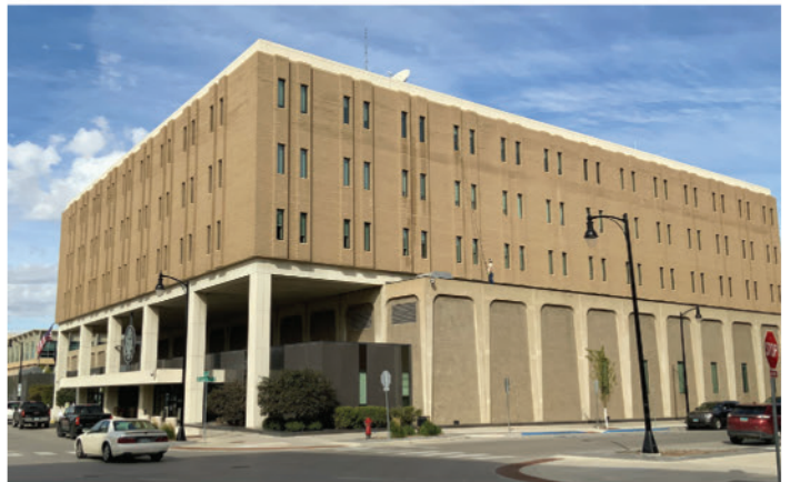
The Federal Building and Post Office in Fargo.