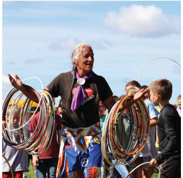
Events at Whitestone Hill State Historic Site included a memorial horseback ride and an education day.

The second Whitestone Hill Memorial Horseback Ride took place on Sept. 3 at the Whitestone Hill State Historic Site near Kulm, where Gen. Alfred Sully's forces massacred 150 to 300 American Indian men, women, and children 158 years ago. Dakota and Lakota descendants and relatives gathered to remember those who died, celebrate their lives, and pray for healing. The Audience Engagement & Museum team recorded the event for incorporation into the historical record.