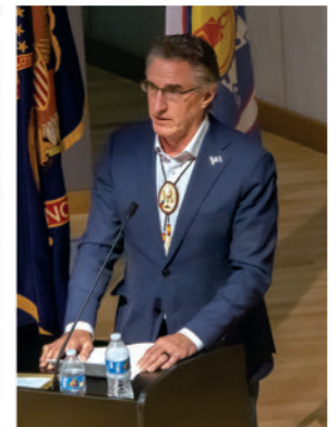
Gov. Doug Burgum pays tribute to the three honorees.