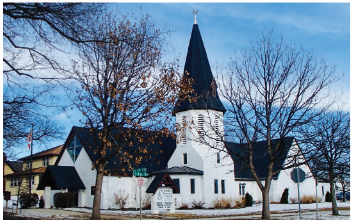
St. George's Episcopal Memorial Church in Bismarck.