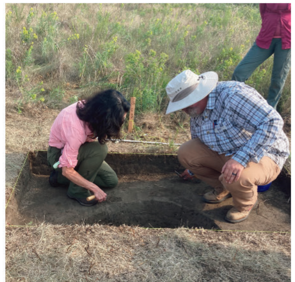
Excavation work at Harmon Village, which may have been briefly occupied in the 17th and 18th centuries.