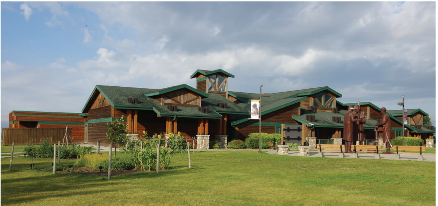
The State Historical Society welcomed the Lewis & Clark Interpretive Center and Fort Mandan into our museums and state historic sites.