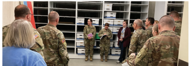
Members of the North Dakota National Guard on a behind-the-scenes tour of the ND Heritage Center.

Members of the North Dakota National Guard toured the ND Heritage Center & State Museum in July, where they learned about museum management practices such as collections care and exhibition planning. The National Guard is in the early stages of exploring the potential of building a military museum to be operated in partnership with the State Historical Society.