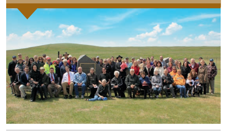
Descendants of North Dakota's Jewish homesteaders gathered at Ashley Jewish Homesteaders Cemetery for a rededication in May.

On May 21, descendants and local residents gathered for a rededication of the Ashley Jewish Homesteaders Cemetery, where members of the Jewish Beth Itzchock congregation were buried from 1913 to 1932. McIntosh County, which includes Ashley, was the largest Jewish agricultural settlement in North Dakota. The cemetery was named to the National Register of Historic Places in 2015.